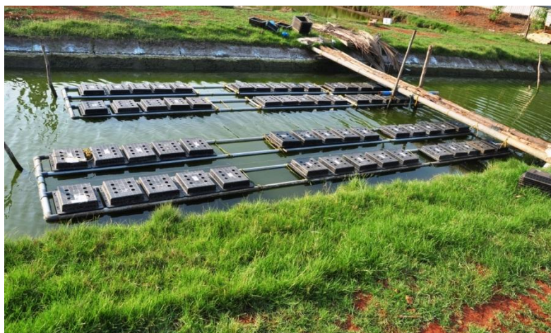
Fig.1. Crab culture in floating boxes