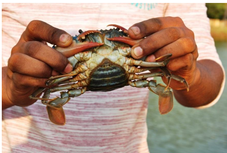
Fig.2. Mud crab, Scylla serrata