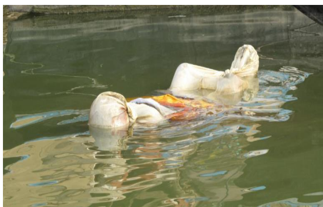
Fig.1 Dead bodies of those who died of COVID-19 float on the Ganga in Bihar's Chausa.

Mining can have a negative effect on the nearby surface and groundwater. The significant volumes of water required for mining activities such as aqueous extraction, mine cooling, drainage, and other mining operations raise the risk that these chemicals may pollute ground and surface water. Due to wastewater pollution, there are few options for disposal since mining generates a lot of waste water. These chemical-laden discharge has the indubitable potential to destroy the nearby flora. The worst-case scenario involves discharging the runoff into several forests or surface waterways. This makes disposing of submarine tailings a preferable choice. Chemical spills often lead to watershed contamination, which has an adverse